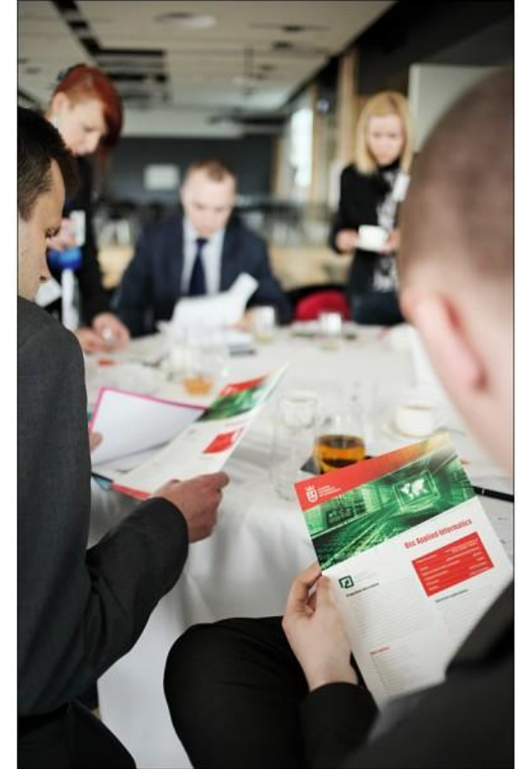
IV Transnational Partner Forum 25-26/4/2012 Warszawa/Warsaw, Poland